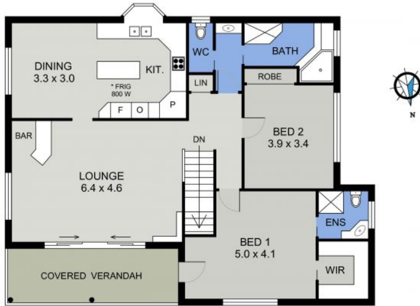
UPPER FLOOR PLAN (133 sq m Approx)