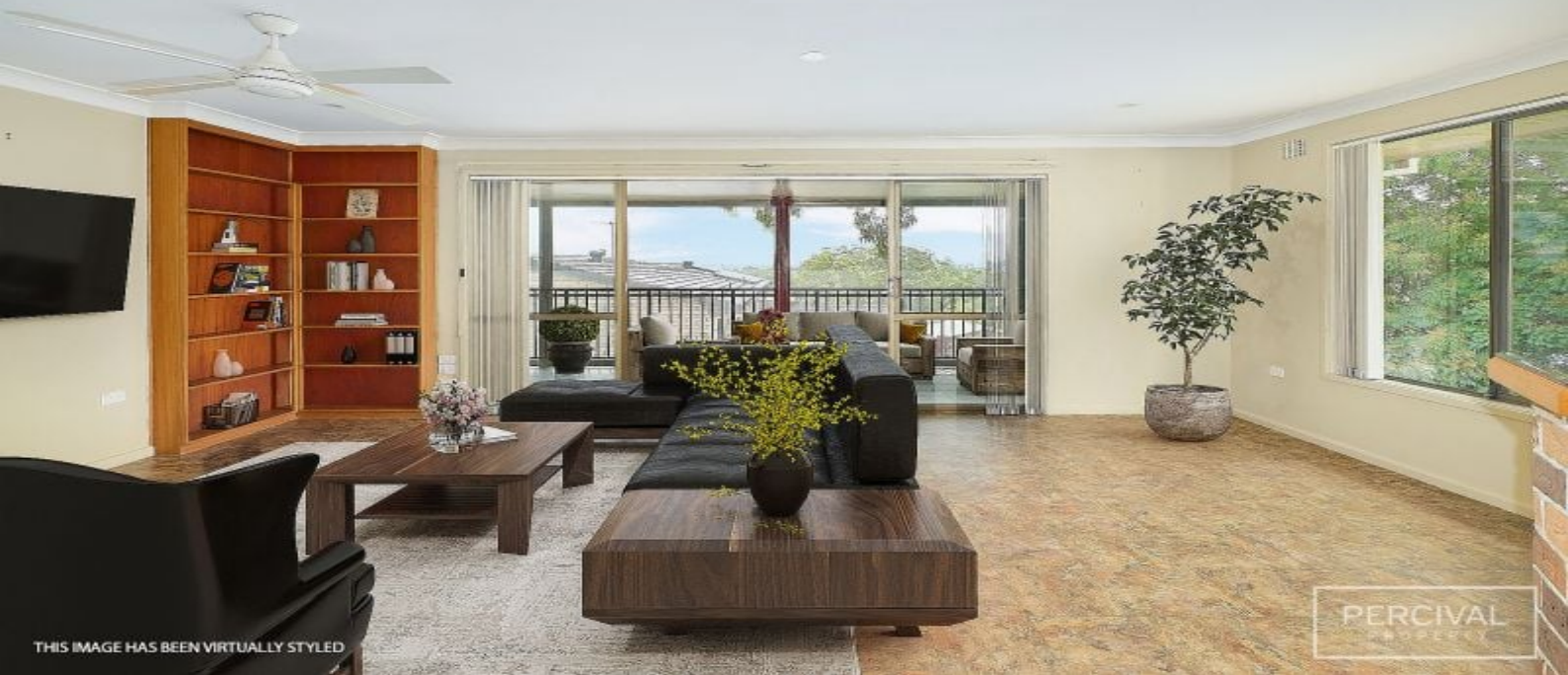
THIS IMAGE HAS BEEN VIRTUALLY STYLED