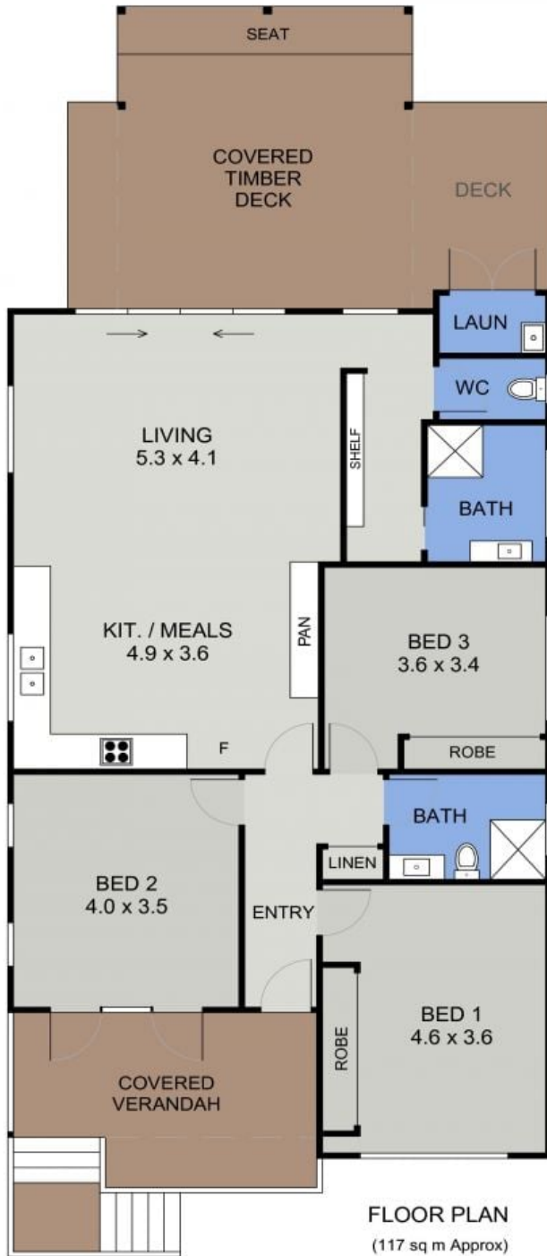
FLOOR PLAN (117 sq m Approx) Scale - 1:80