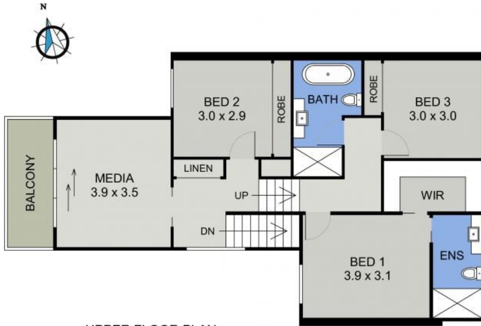
UPPER FLOOR PLAN (78 sq m Approx)